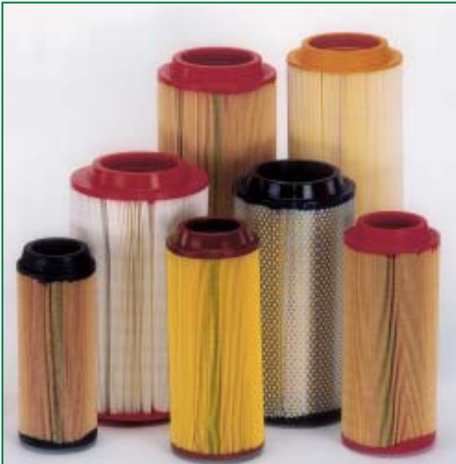
Inferior copies – high risk

Original products have always been copied by pirates and offered at lower prices. But a farsighted operator of a compressed air system will know that copies are products with an inferior quality which do not fit properly and force running costs up. Indeed they endanger the economic running of the compressed air system. In the worst case copies can lead to shutdown of the compressor.