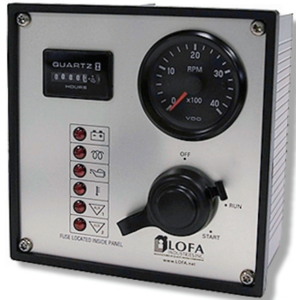
Pictured Above: EL240G1HS

The standard system includes a 12" wiring harness terminating into a sealed weatherproof plug. This durable connection performs well in harsh environments and provides efficient installation of custom plug and play engine harnesses as well as standard harness extensions.