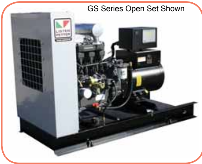
The set illustrated is not necessarily the standard build.

Rating Conditions: All ratings calculated at sea level, 77°F and 30% humidity with generator set at normal operating temperature. Standby Rating: The power that the generator set will deliver continuously under normal varying load factors for the duration of a power outage. Prime Power: Power that the generator set will deliver when used as a utility type power plant under normal varying load factors to run continuously. This rating requires a minimum momentary overload capability of 10%.