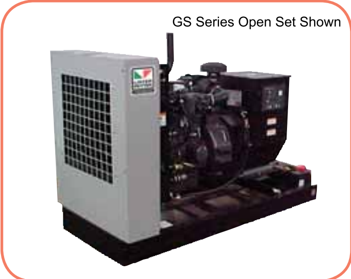
GS Series Open Set Shown