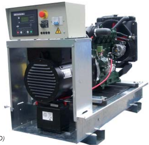
Open Set (LLD)