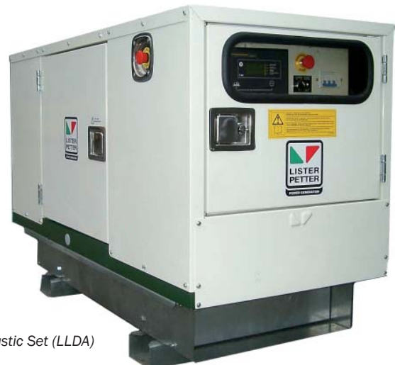
Acoustic Set (LLDA)