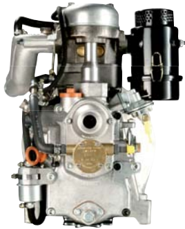
15 W / 18 W